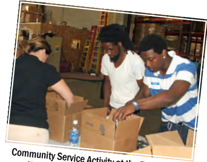
Community Service Activity at the Food Bank - WTC Consumers Practice Work Skills