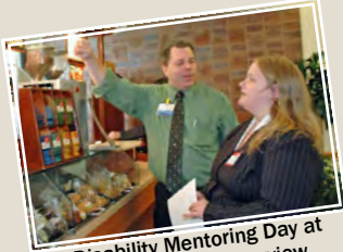
Disability Mentoring Day at Johns Hopkins Bayview

MARYLAND'S ADVOCATES FOR PUBLIC VOCATIONAL REHABILITATION